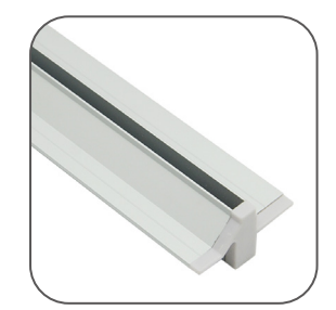
Alu Profile+End Cap