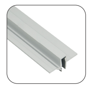
Alu Profile (Back)